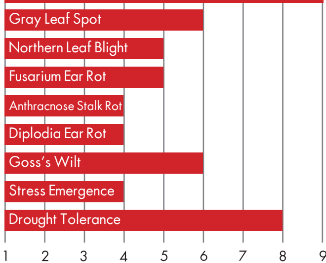
RATINGS: 1 is Poor, 5 is Intermediate, 9 is Excellent, – is Insufficient Data. Plant populations vary by regions.